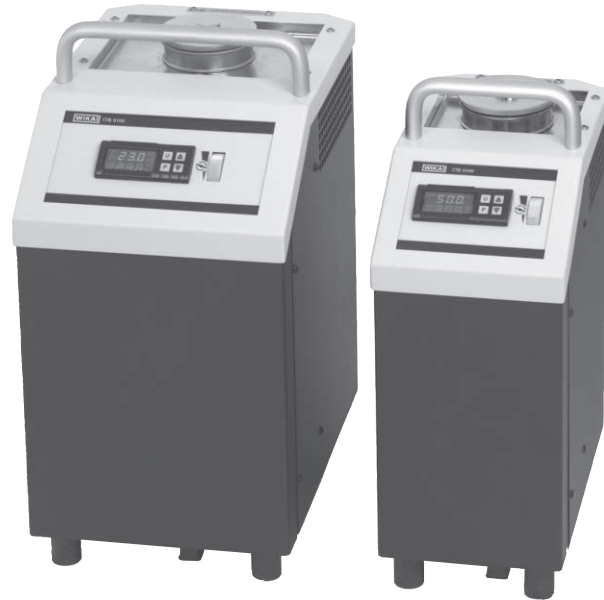
Micro calibration baths CTB9100-165 and CTB9100-225