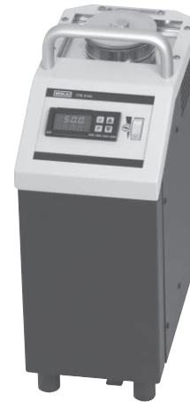
Micro calibration bath CTB9100