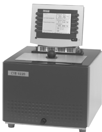
Calibrations Bath Model CTB9220