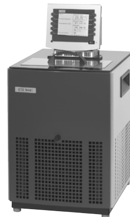
Calibration Bath Model CTB9441

However, it is not just the bath that is important, but also the bath fluid used. To ensure homogeneous temperature distribution, the selected fluid should have a high thermal conductivity and low viscosity. Moreover, the fluid should be inert, have a low vapour pressure, should not decompose chemically, not burn, and should maintain its properties over a wide temperature range.