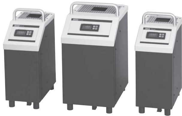
Temperature dry well calibrator Model CTD9100