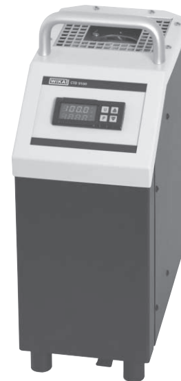
Temperature Dry Well Calibrator CTD9100-650